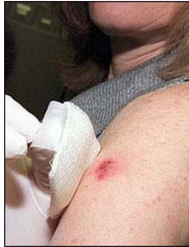
A monkeypox outbreak, linked to pets, could expand use of smallpox vaccine.