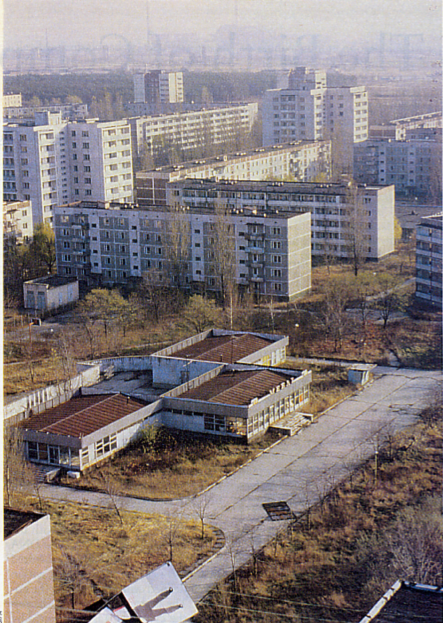
GHOST TOWN: Pripjat, a once vibrant city of 45,000, was home to many of the workers from the Chornobyl plant. It was evacuated after the accident and remains deserted.

The event offers a vivid demonstration of the failures of the monopolistic Soviet political and scientific system. The emphasis under that regime was on secrecy and on simplifying safety features in order to make construction as cheap as possible. International experience with reactor safety was simply disregarded. The calamity underscores, further, the