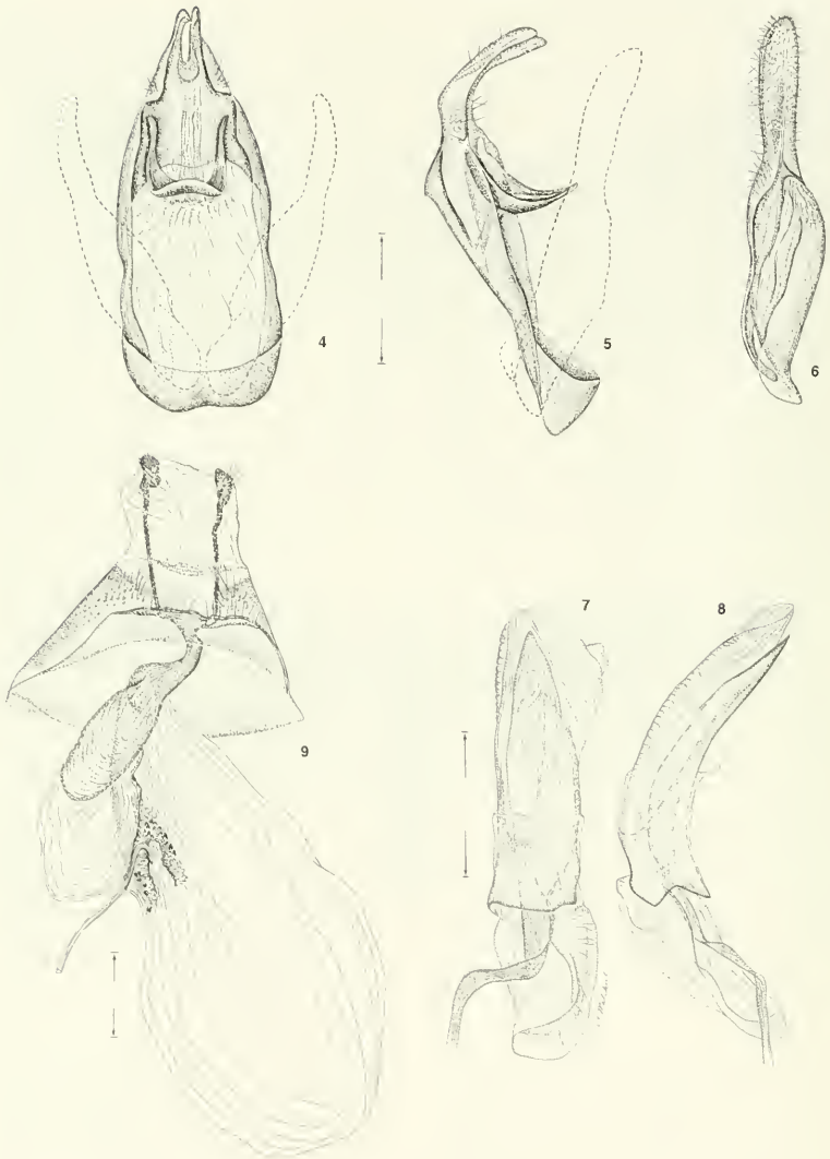
Figs. 4-9. Genitalia of Amydria anceps . 4, Male, ventral view (0.5 mm). 5, Lateral view of fig. 4. 6, Valva, mesal view. 7, Male aedeagus, ventral view. 8, Lateral view of fig. 7. 9, Female, ventral view (0.5 mm). Scale lengths indicated in parentheses.