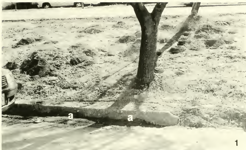
Fig. 1. A mature colony of Atta mexicana in the urban area of Monterrey, Mexico. The substrate accumulations on the street by the curb (a) consist of the spent fungal material (dumps) characteristic of this leaf-cutter ant.

G. Mueller, personal observation) frequently deposit the piles adjacent to the nest. The Atta substrate dumps, whether subterranean or exposed, constitute an accumulation of organic matter that attracts an abundant and diverse community of invertebrates (Waller and Moser 1990) and microorganisms (Rogers et al. 1995, Hart and Ratnieks 2001, Sanchez-Pena, unpublished observations).