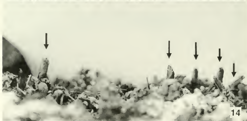
Figs. 13-14. Larval tubes and pupae of Amydria anceps . 13, Dump mound of Atta mexicana colonized by Amydria larva; tubes (t) with active larvae are visible on dump's surface. Erosion has removed some of the substrate that normally completely covers the tubes. White 35 mm film container included for scale. 14, Five pupal exuviae (arrows) after adult emergence, on dump surface, protruding nearly perpendicular 7-10 mm from substrate. The exuviae remain attached to the buried larval tubes, which open to the surface.

posterior ridge also reduced on 7-8 and completely encircling each segment. Cre-master of A10 consisting of a large, prom-