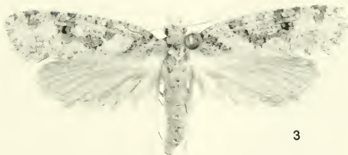
Figs. 2-3. Adults of Amydria anceps . 2, Male, forewing length 5.5 mm. 3, Female, forewing length 12 mm.

sae which extends about 3\times length of apophysis; a small accessory bursa branching off caudal end of corpus bursae at common juncture with ductus bursae; basal, ventral half of accessory bursae wall with an elongate-oval ring of thickened tissue; corpus bursae with an elongate, dense, coarse patch of small, irregularly shaped, short spicules extending a short distance